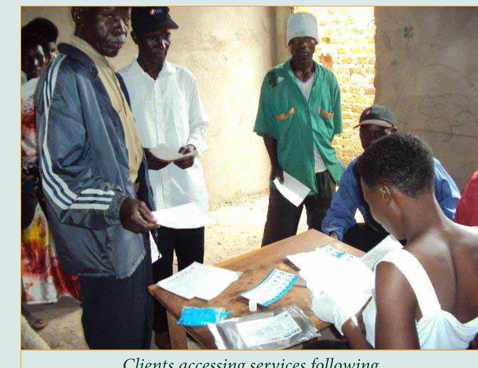
Clients accessing services following referral from the community

Strengthened referrals, linkages and collaborations between communities and health centers, combined with innovative approaches to working with community structures and support for routine sharing among stakeholders can significantly improve access to and greater utilization of critical HIV, TB and wrap-around services.